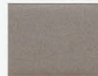
Cool Metallic Silver**