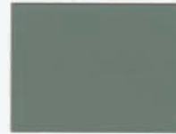
Cool Marine Green