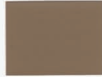
Cool Zinc Gray