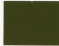
Cool Forest Green