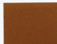
Cool Copper Penny**