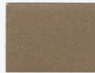
Cool Metallic Champagne**

* Desert Beige and Cool Sculpture Bronze are available standard colors in 26 Ga. and 24 Ga. steel only. These colors are available in 22 Ga. steel as Premium I colors only.