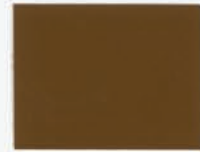
Cool Sculpture Bronze*